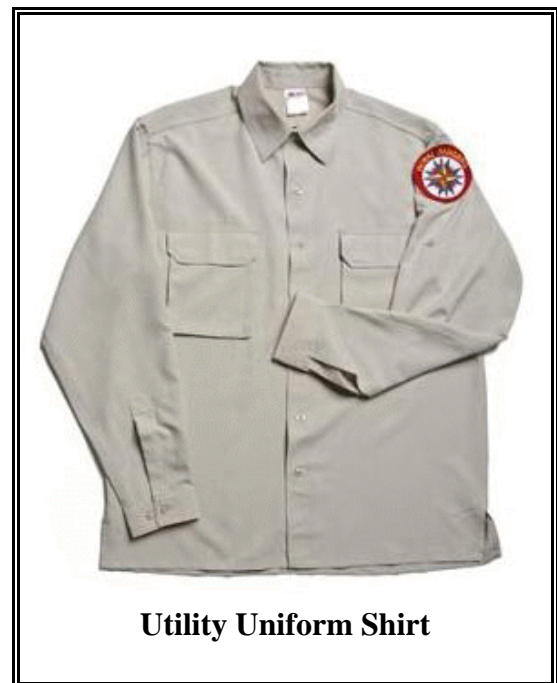
Utility Uniform Shirt