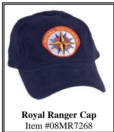
Royal Ranger Cap Item #08MR7268

The next item on the list for uniform parts is the hat. This is a baseball style cap with the Royal Rangers emblem on the front. These hats are $11.95 and are adjustable so they are only offered in one size.