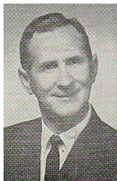
This picture was in the Church of God Witness 1966 Camp Meeting Issue